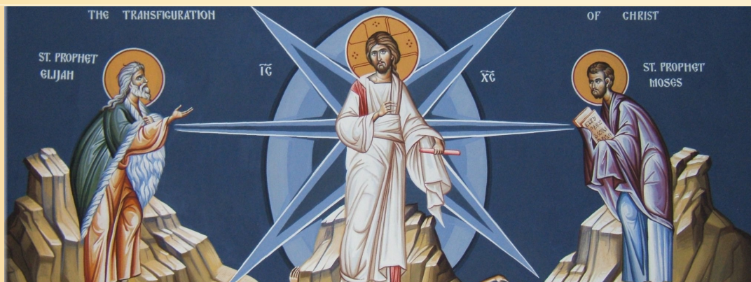
The Holy Transfiguration of Our Lord, God and Savior Jesus Christ Feast of our Lord. Holy Day of Obligation.