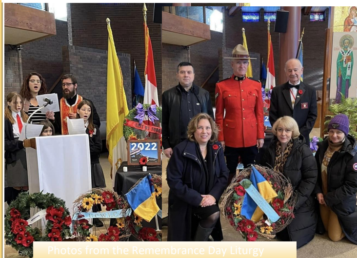
Photos from the Remembrance Day Liturgy

DONATIONS WELCOME Please consider a small donation to support our initiative. Please visit our website for details.