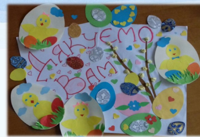
"Львів. Квітень-2021" "L'viv. April 2021"

Дорогі Добродії з Калгарі! Сестри Службниці зі Львова щиро вдячні за те, що завдяки Вам ми могли передати бідним діткам продукти. Нехай Господь Вас одарує своїми благодатями! Ми молимося за Вас і Ваші Родини!