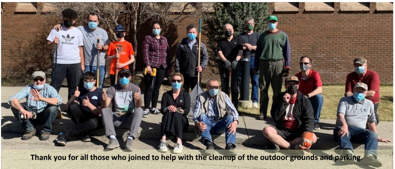
Thank you for all those who joined to help with the cleanup of the outdoor grounds and parking.