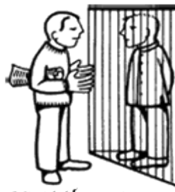
Visit the prisoner

Prayer & Support Group: Accepts prayer requests for the confidential needs and intentions of parishioners and others.