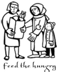
Feed the hungry

Jesus said that when he comes again he will come as a shepherd. He will call all the sheep, who are the people who love and follow Jesus, and He will say: "Come, you are My family. The Kingdom of God is yours because when you chose to love and help others by giving them drink, food, clothes, hospitality, rest, it was the same as loving and caring for Me." Jesus will say to the goats, who are people who did not choose to follow Jesus, "I am sorry but I do not know you. You must leave!"