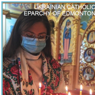
UKRAINIAN CATHOLIC EPARCHY OF EDMONTON