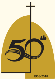
St. Stephen Protomartyr Ukrainian Catholic Parish