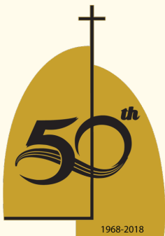
St. Stephen Protomartyr Ukrainian Catholic Parish