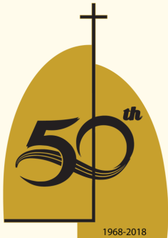
St. Stephen Protomartyr Ukrainian Catholic Parish