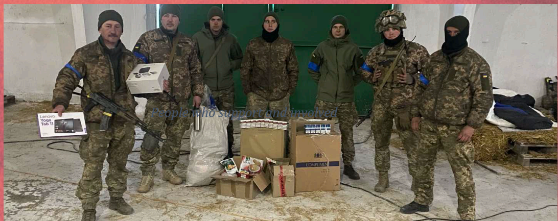
People who support and involved