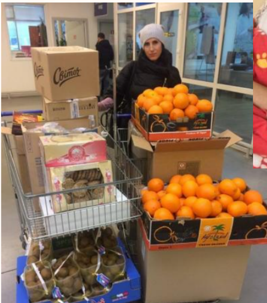
One of my mornings looks like this. Besides buying medications, helping financially – we need to keep our boys healthy while they are lying in bed – they need vitamins!