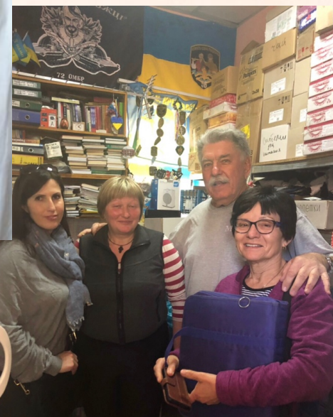
People who support and involved