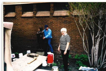
EVERYONE NEEDS A FOREMAN