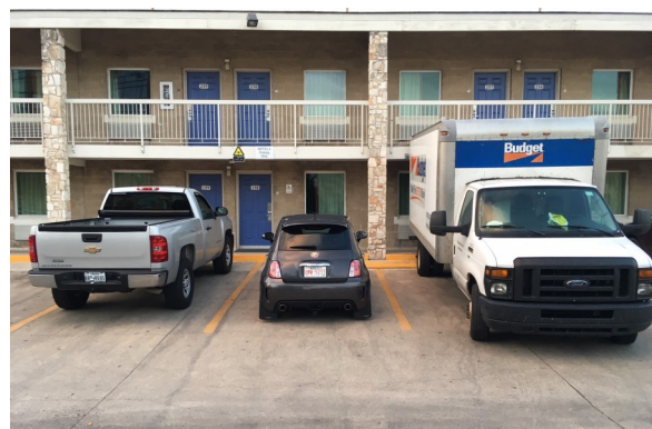
Bella invaded by trucks at Motel 6, San Antonio TX